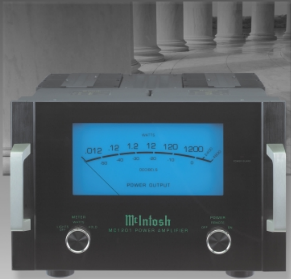
MC1201 Monoblock Power Amplifier